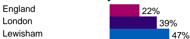
Chart 1. Proportion of workers on zero hours contracts by area

Around half (47%) of the workforce in Lewisham were on zero-hours contracts. Around two thirds (66%) of the workforce usually worked full-time hours and 34% were part-time.